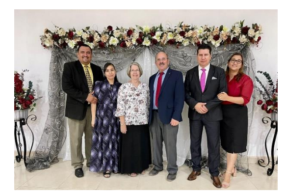
Anniversary Conference speakers

<u>Teaching at sister church's</u> <u>Bible Institute</u> (Mazatlán)