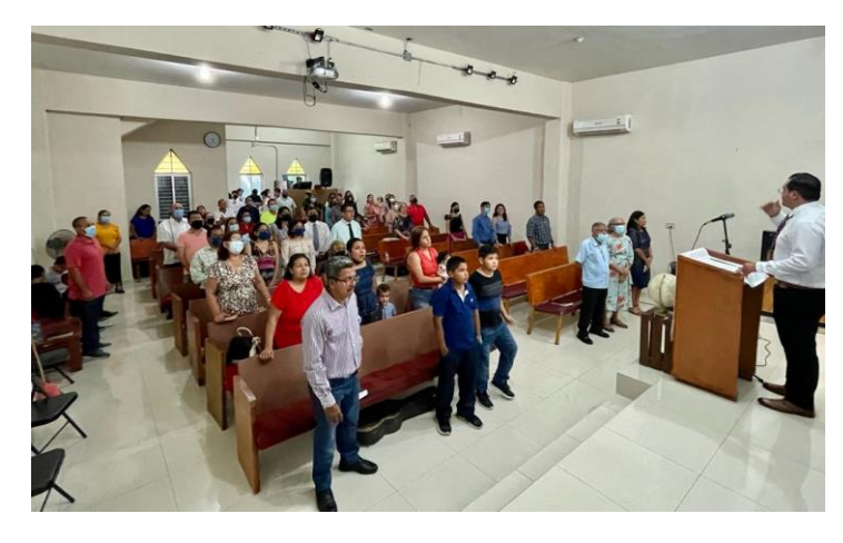
Monthly Pastor's / Men's Fellowship (video)