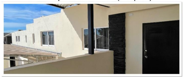
Pastor's Apartment (3 bdrm/2 bath), office with 2 classrooms and "Prophets Chamber" (sleep 5+)