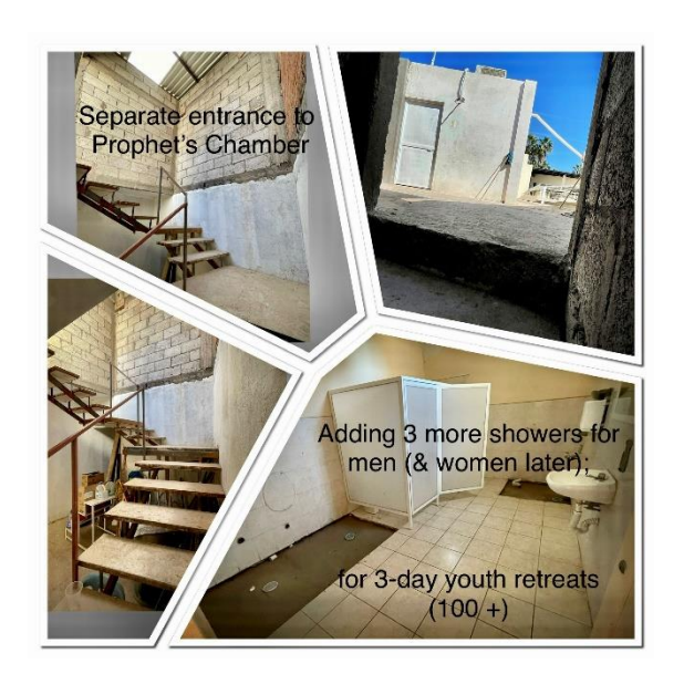
Additional project : adding 3 showers each to men's/women's bathrooms